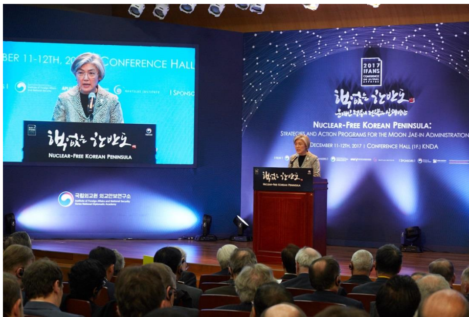
Kang Kyung-wha, delivering Keynote Speech, Opening Session, December 11, 2017.