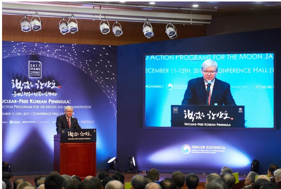
Kevin Rudd, Auditorium, KNDA, December 11, 2017, Session I.