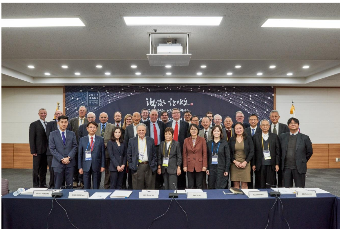
Group photo, Closed Roundtable, International Conference Room, December 12, 2017.