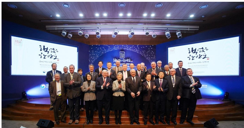
Group Photo, Auditorium, KNDA, December 11, 2017.