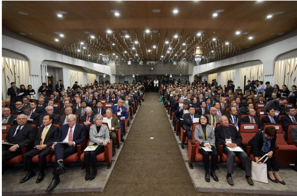
Gathered delegates, Opening session, Auditorium, KNDA, December 11, 2017.