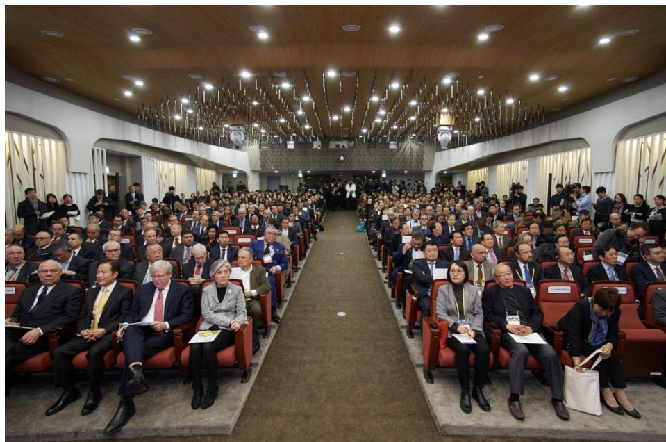
Attendees and presenters, Auditorium, KNDA, Opening Session, December 11, 2017.