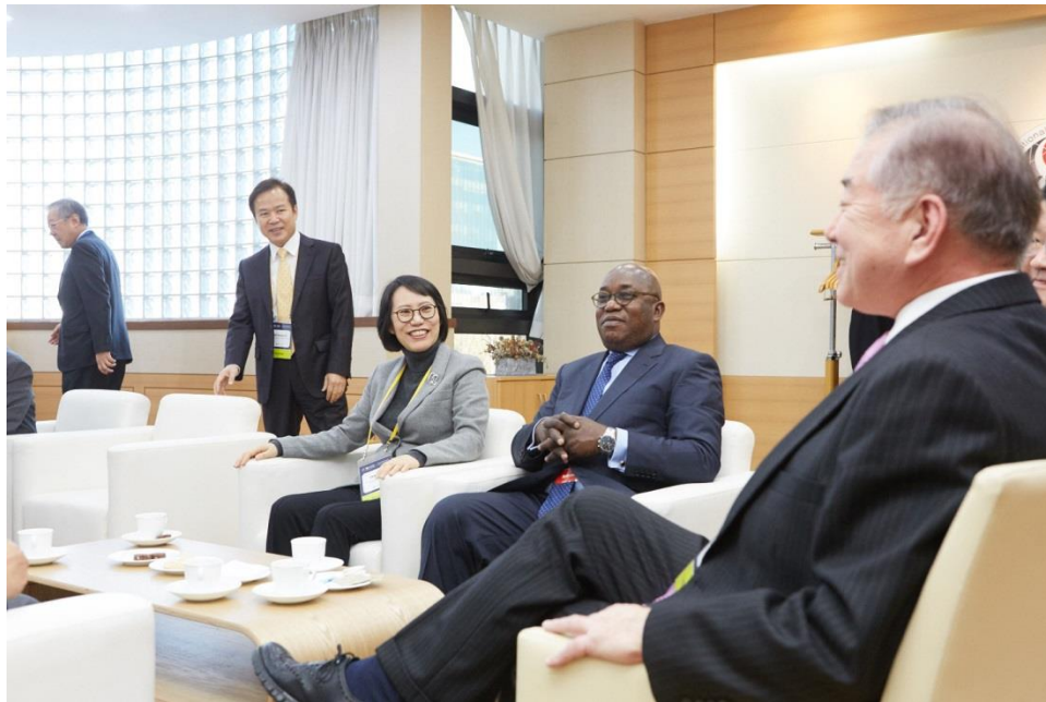
Registration session, KNDA, December 11, 2017.