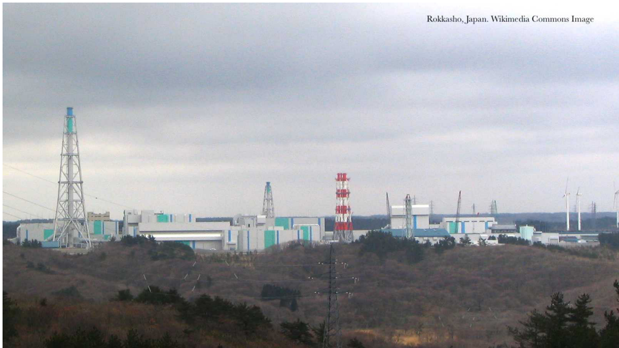
Rokkasho, Japan.

Because it is difficult to tell what the state's intentions are, or to predict what they may be at some future time, from a non-proliferation perspective the fewer national enrichment and reprocessing programs there are the better, and vice versa, the more widespread these capabilities become, the greater the risk of proliferation, now or in the future. If a number of states decided to pursue these capabilities there is the risk of virtual arms races, undermining international trust and destabilising the non-proliferation regime.