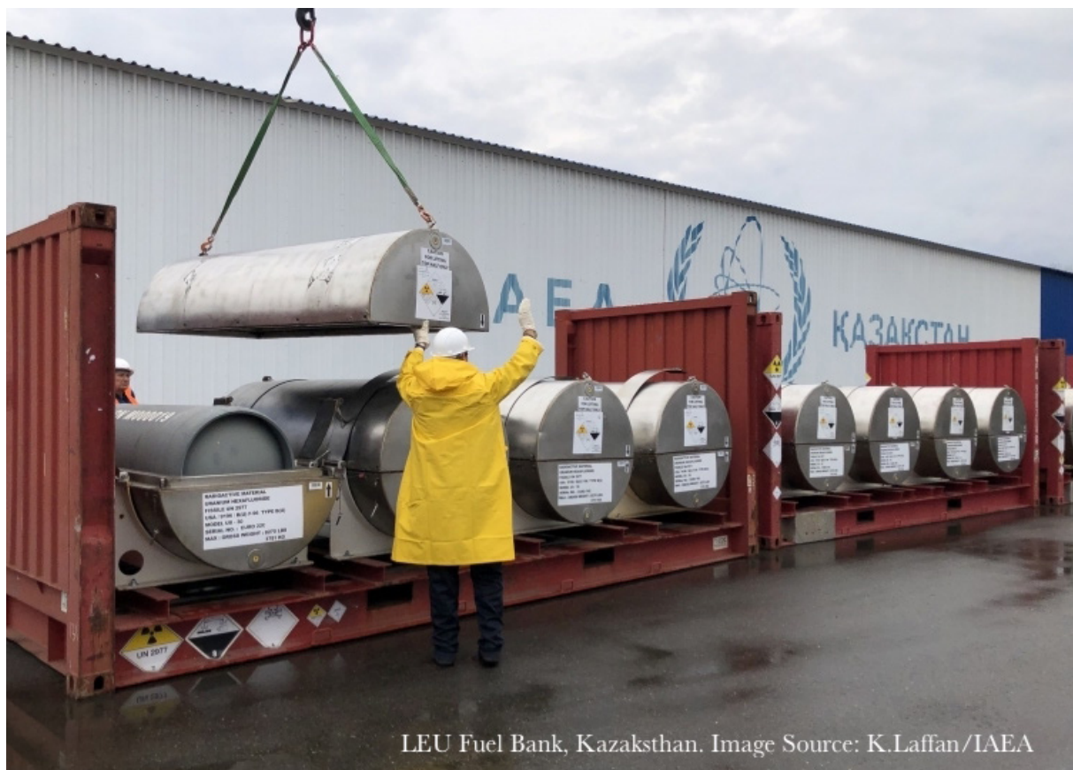
LEU Fuel Bank, Kazakhstan.