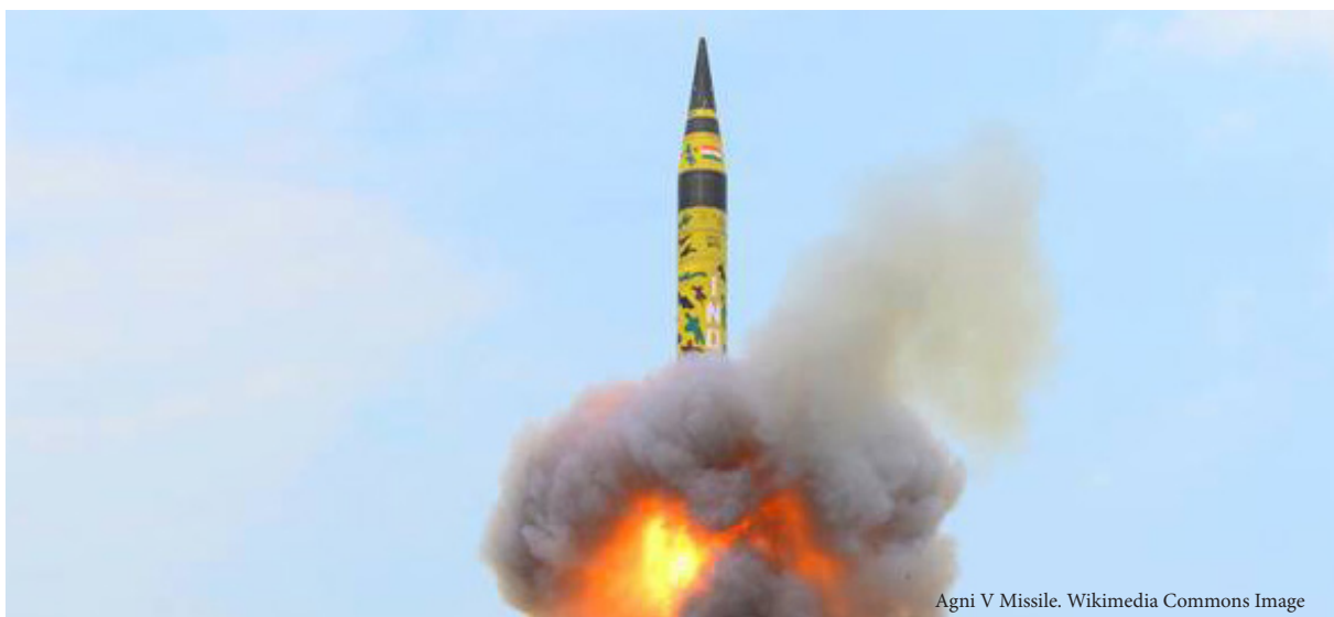
Agni V Missile.

Is there an Agni-6 under development? India has not mentioned an Agni-6, but there is speculation that one is being developed. 49