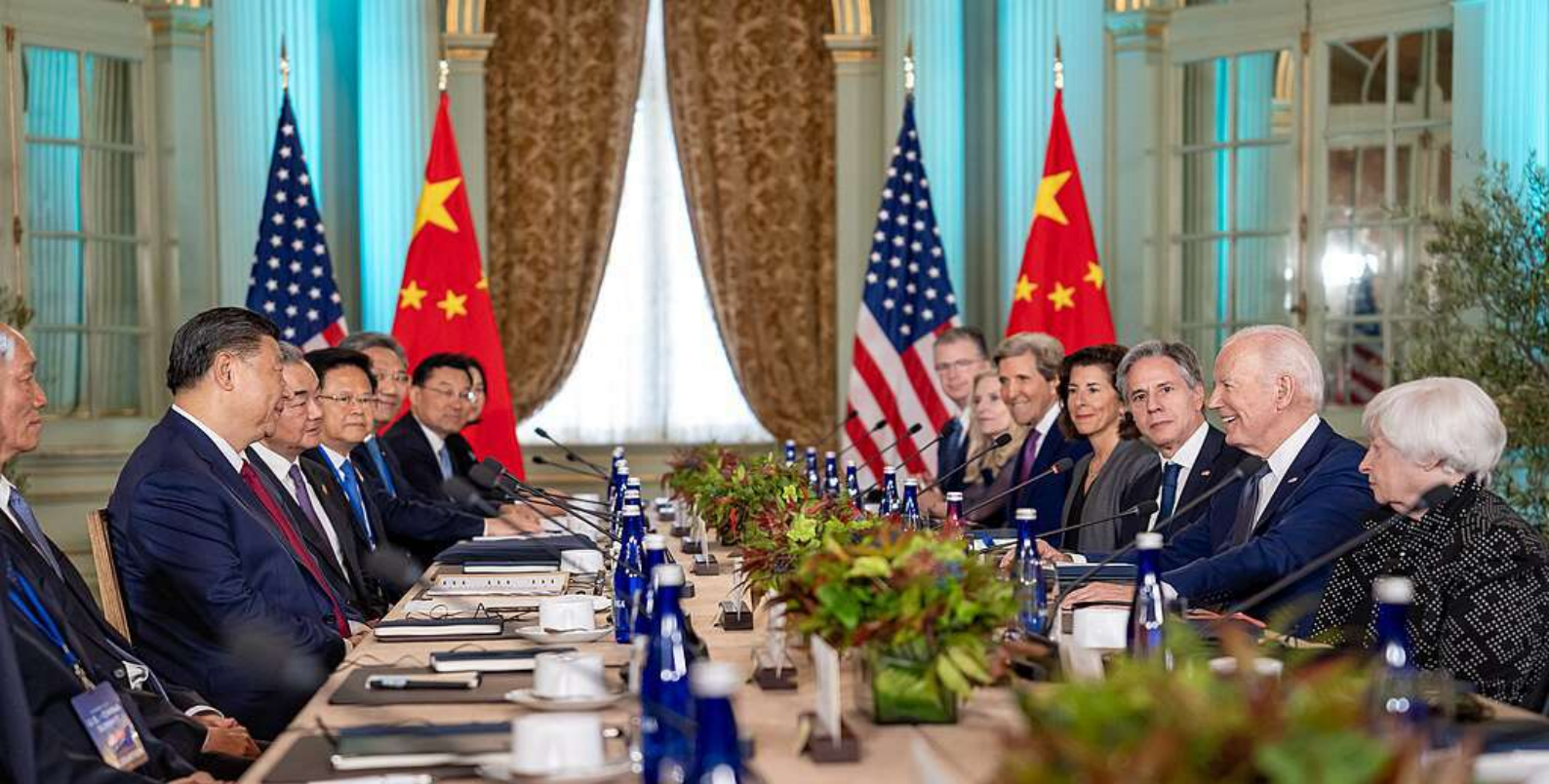
President Joe Biden hosts a bilateral meeting with President of the People's Republic of China Xi Jinping, Wednesday, November 15, 2023, at the Filoli Estate in Woodside, California.