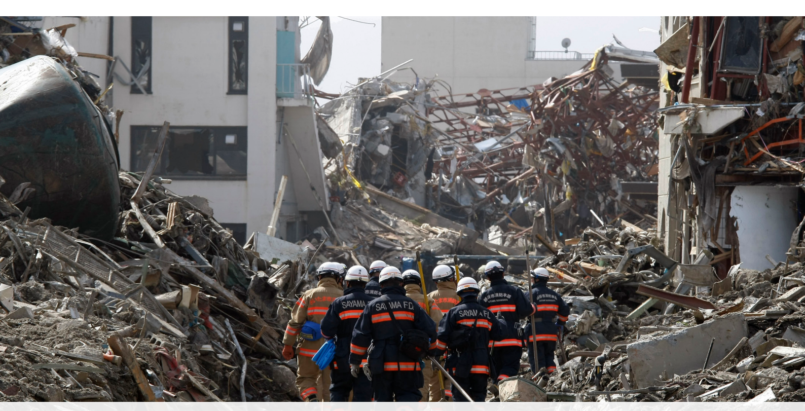
Rescue Team searching operation on debris and mud covered at Tsunami hit Destroyed city in Rikuzentakata on March 20, 2011, Japan.

Responsible countries will undertake some kinds of disaster relief efforts. However, despite the expectations of global actors, they may choose to engage in blame-shifting rather than participate in meaningful dialogue to resolve disputes for a greater good of humanity. This will mar the ability of the UN and its agencies to carry out rescue, relief, and rehabilitation operations. Additionally, fulfilling the critical expectations of the international community in a time of such dire need is far from certain. The complex and multi-faceted nature of the humanitarian crisis caused by a nuclear attack makes it an incredibly challenging situation, further complicated by political, social, and legal strains.